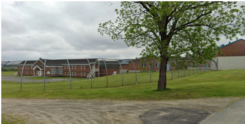
Maine Youth Center