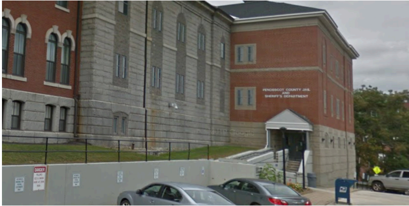
Penobscot County Jail